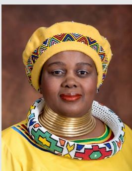
Hon Mmamoloko Kubayi: Minister of Justice & Constitutional Development

Ms Mmamoloko Kubayi was appointed Minister of Justice and Constitutional Development in December 2024, following her tenure as Minister of Human Settlements. A Member of Parliament, she has held various ministerial positions, including Tourism, Science and Technology, Communications, and Energy. Ms Kubayi also acted as Minister of Health during the COVID-19 pandemic. She is the Chairperson of the ANC's Economic Transformation sub-committee and has contributed to strategic governance discussions globally, including as a member of the World Economic Forum's Global Future Council on Sustainable Tourism. She holds a BA from the University of Johannesburg, a Postgraduate Diploma in Project Management, and a Masters in Public and Development Management from Wits University. She has completed leadership programs at Harvard Business School and is currently pursuing a PhD in corporate governance. Minister Kubayi began her career in community development and financial services before transitioning to government, where she has played a crucial role in public administration and policy-making.